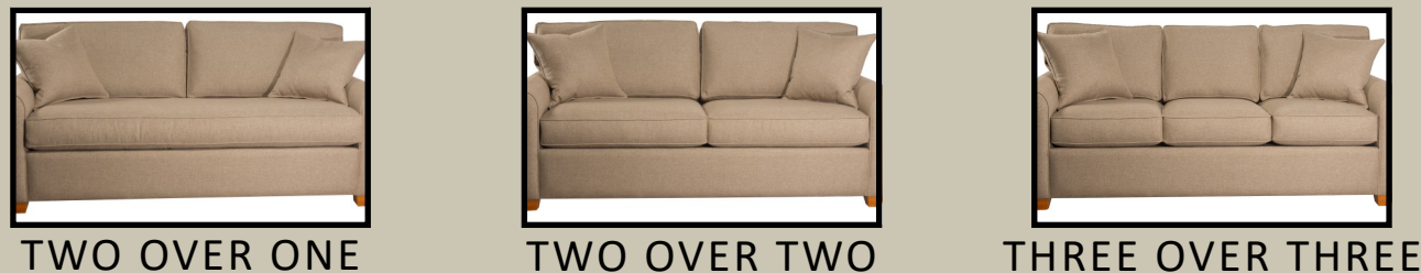
TWO OVER ONE TWO OVER TWO THREE OVER THREE