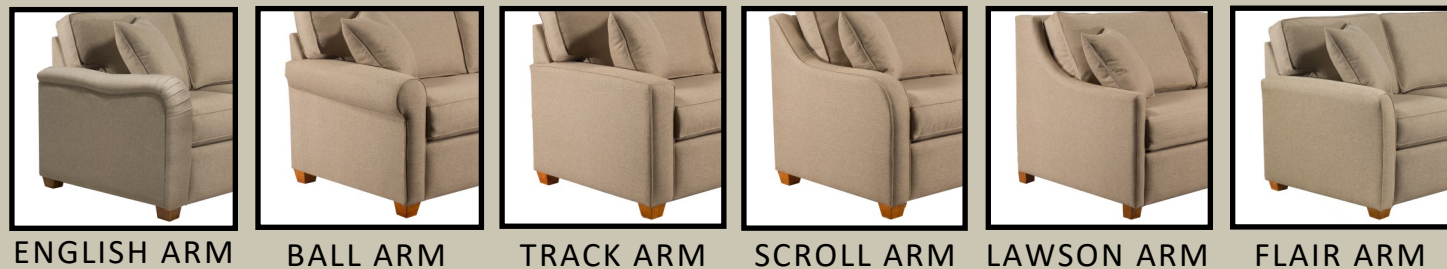
ENGLISH ARM BALL ARM TRACK ARM SCROLL ARM LAWSON ARM FLAIR ARM